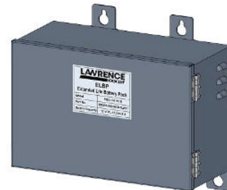
ELBP Extended Life Battery Pack