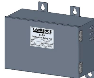
ELBP Extended Life Battery Pack